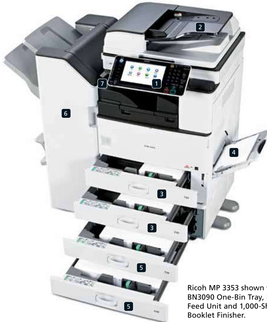
Ricoh MP 3353 shown with optional BN3090 One-Bin Tray, PB3180 Paper Feed Unit and 1,000-Sheet SR3150 Booklet Finisher.