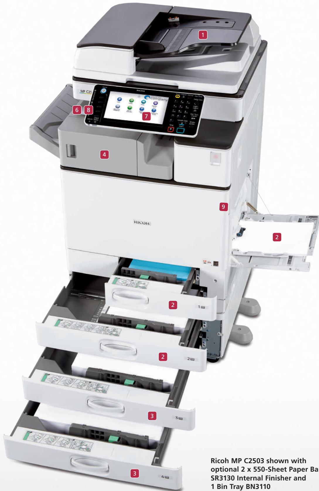
Ricoh MP C2503 shown with optional 2 x 550-Sheet Paper Bank, SR3130 Internal Finisher and 1 Bin Tray BN3110