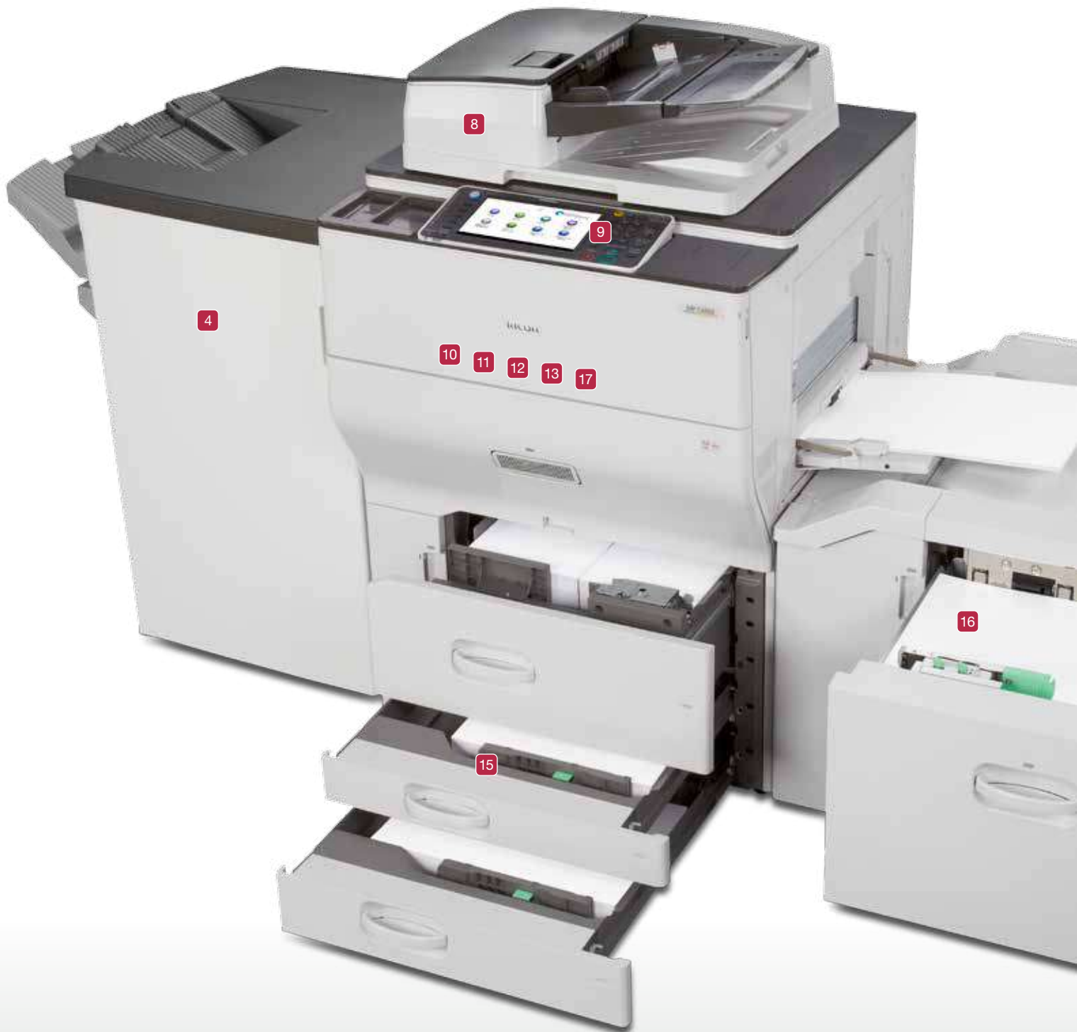
Ricoh MP C6502/MP C8002