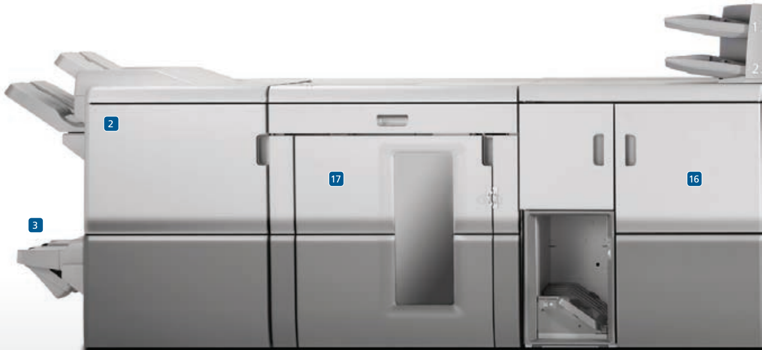
RICOH Pro 8100 Series