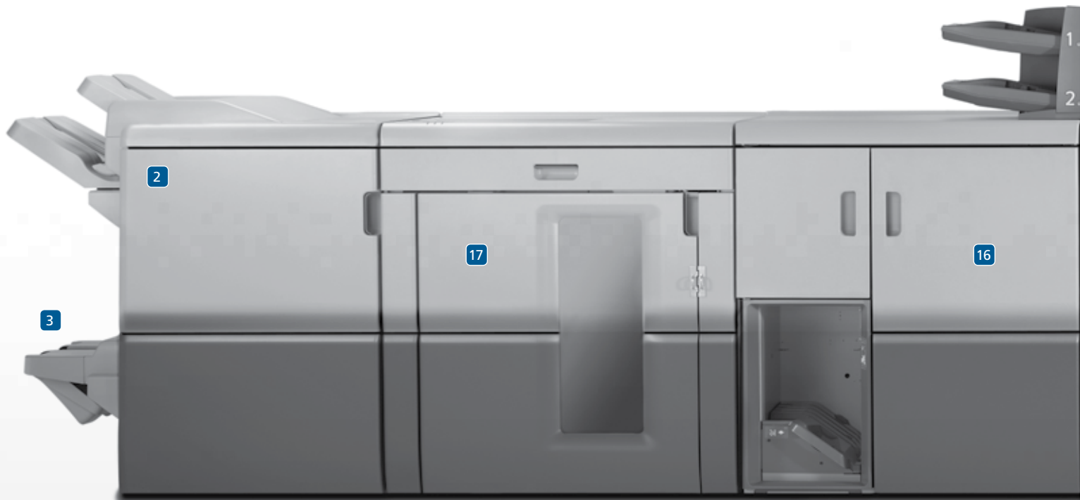
RICOH Pro 8100 Series