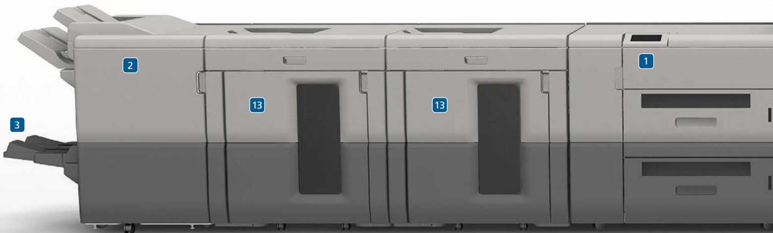
RICOH Pro 8220s