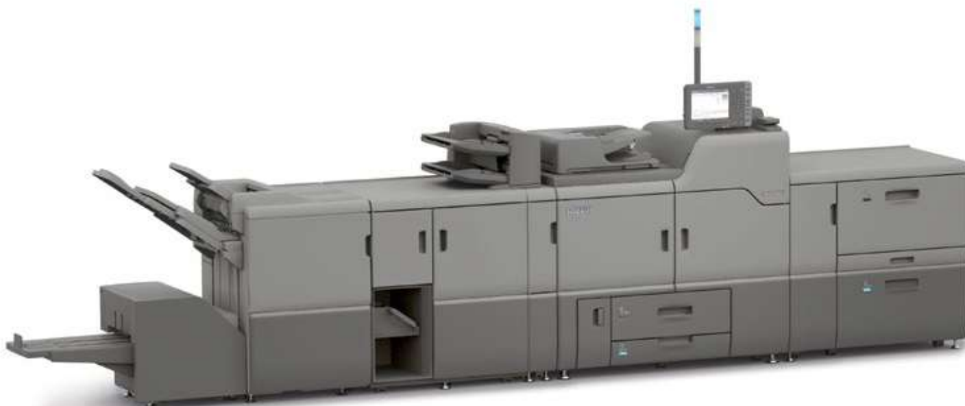
RICOH Pro C7100S

For maximum performance and yield, we recommend using genuine Ricoh parts and supplies.