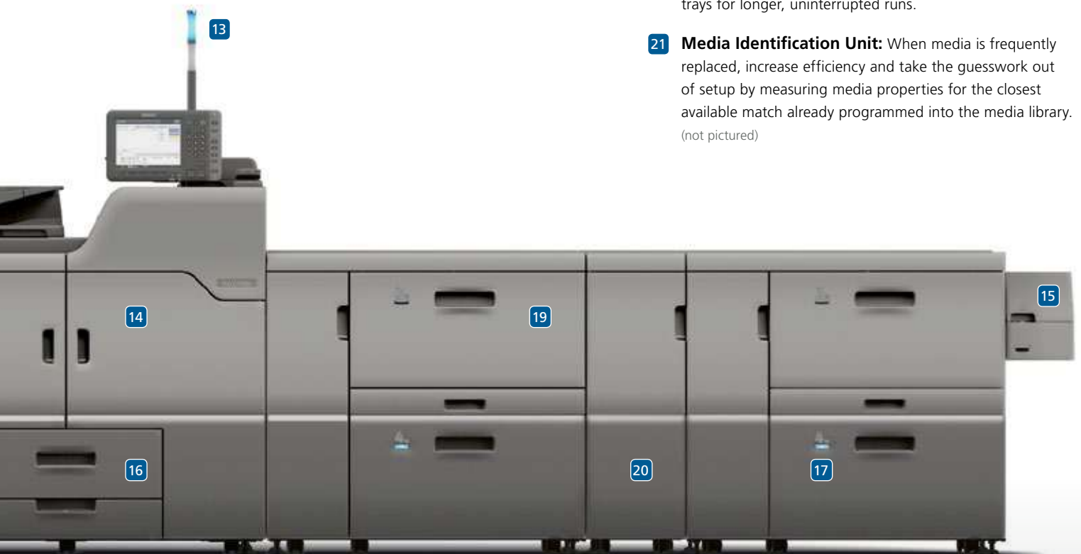
RICOH Pro C7110S